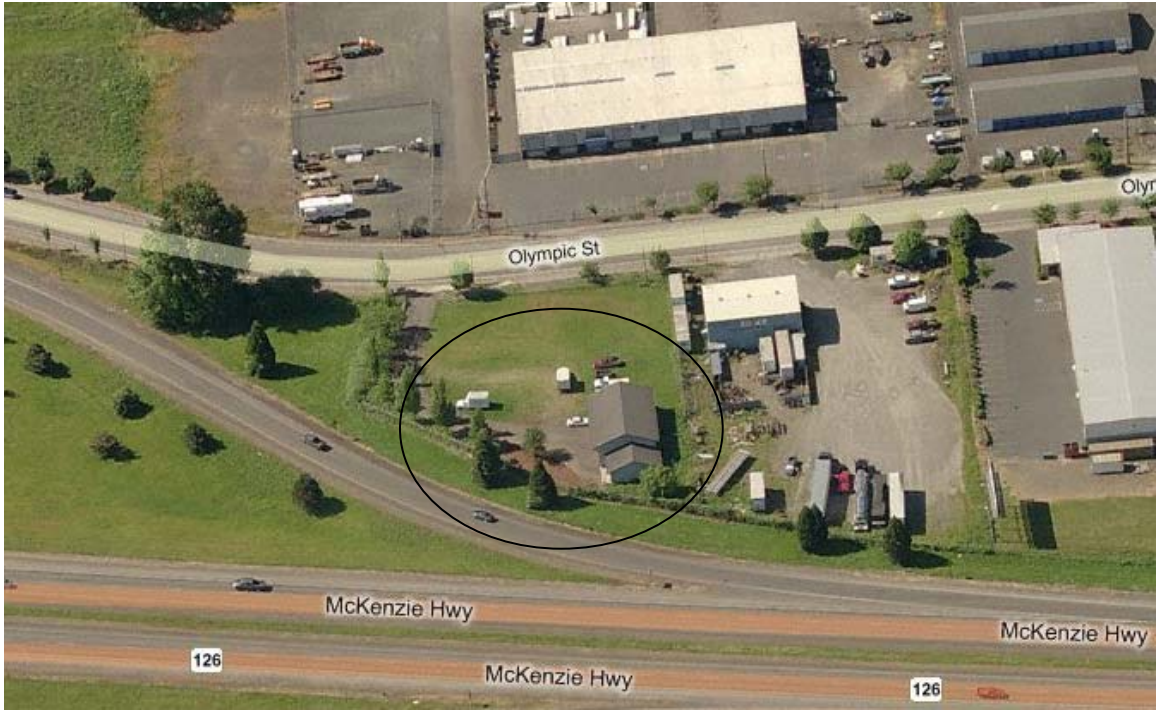
Alternative perspective of subject site.