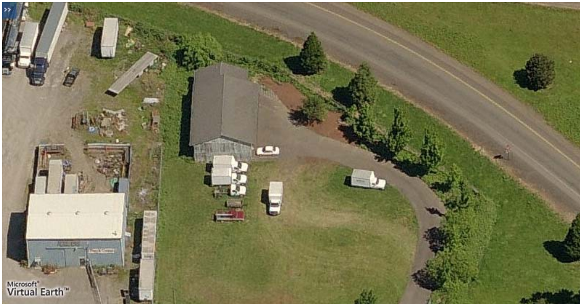
Building proposed for impounded vehicle storage.