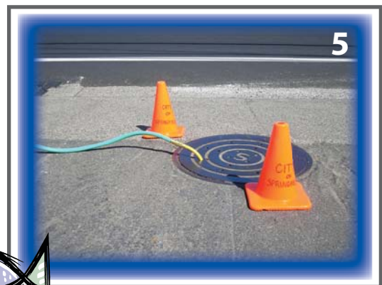
Step 5. Place the two orange cones on either side of the sanitary manhole.