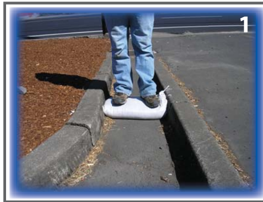
Step 1. Place the sandbag between the two curbs. Stand on it to wedge it in making it water tight.