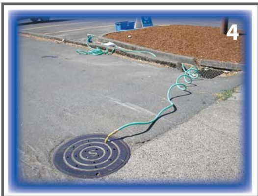
Step 4. Insert the end of the garden hose with the yellow reducer tube into the sanitary manhole located in the driveway.