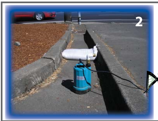
Step 2. Place the pump to the side of the sandbag closest to Papa's. Once water starts to pool check to be sure the pump is in the water.