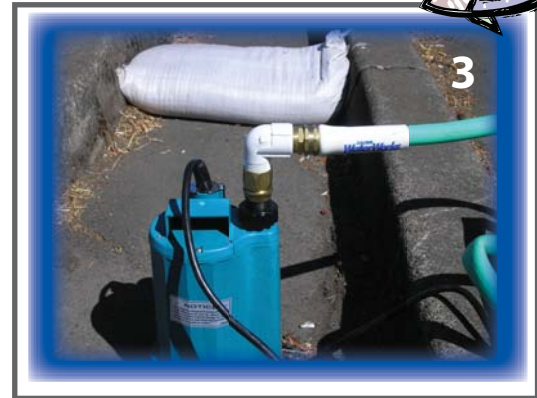
Step 3. Attach garden hose to pump (at white adapter location). A "snug" fit will do...forcing it more than this may strip the adapter and cause it to leak. NOTE: Attach the end with the swivel for easier turning.